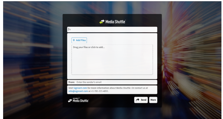
MEDIA SHUTTLE SEND PORTAL INTERFACE