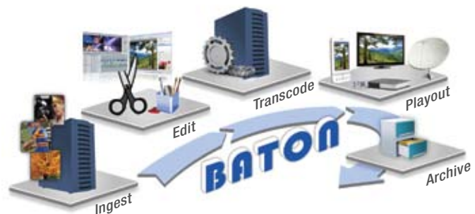
Baton – Maximizes Monetization and Improves Efficiencies across Content Lifecycle